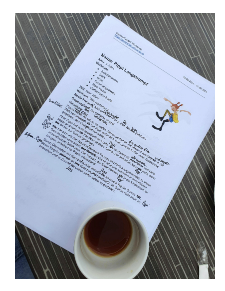
Figure 2: Presenting fictional characters as non-binary

use, and the multiciplity of gender-fair strategies, of which each group was instructed to select one.