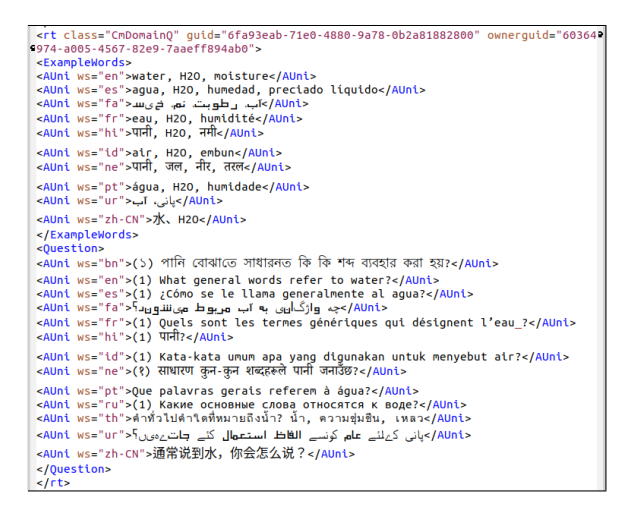
Figure 5: XML data extracted from SIL Fieldworks for the first question of SemDom 1.3 Water

but also – and most importantly – we wanted to link the answers to the questions within each SemDom (see Figure 1), as this is the primary data collected during the RWC workshops. These words are referred to as example words within FieldWorks, so this is the nomenclature we will use.