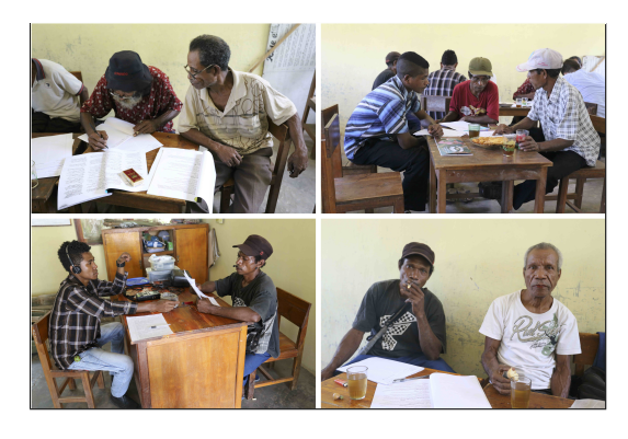
Figure 2: Abui participants of the Rapid Word Collection workshop, July 22-26, 2013