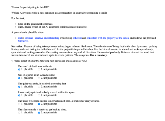
Figure 2: The simile plausibility interface with the missing CSS styling.