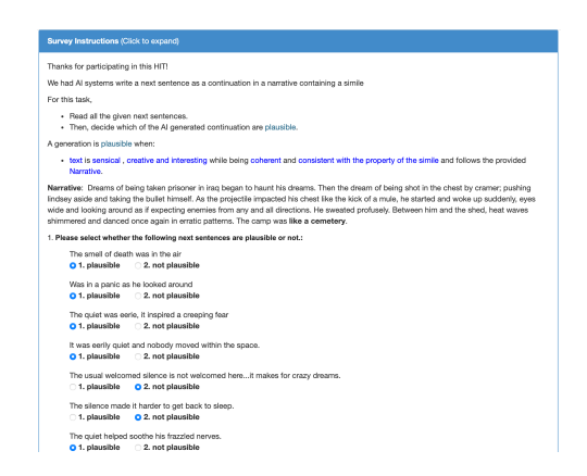
Figure 3: The simile plausibility interface with the restored CSS styling.

The missing CSS for the simile plausibility task was simply dealt with by re-instating the CSS by uncommenting the code in the interface HTML file resulting the interface as shown in figure 3. As for the missing interface file, after consultation with an organiser from the ReproHum project, a decision was made to copy the interface used from the simile task and make the relevant adaptions for the idiom task. In particular, this involved reducing the number of human text options from five to three