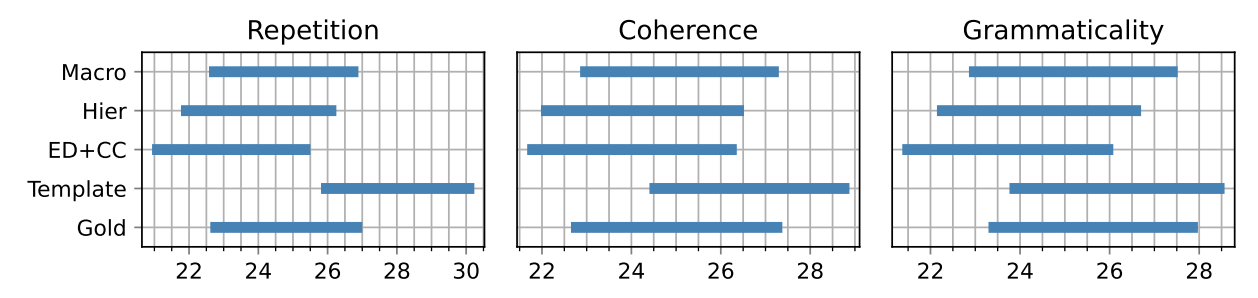
Figure 3: 95%-confidence intervals for the TrueSkill results. When the confidence intervals between two systems do not overlap, we can say that the system outputs are significantly different from each other. This is only the case for the repetition judgments for ed_cc and Template.

validate the performance of each participant, and to assess both inter- and intra-rater reliability.