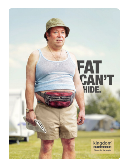
Figure 6: Example of a biased image

The caption generated by our OFA model is not the best fit for the current task. In most of the cases, the captions are general. Character attributes play a major role in associating the character with the image content. To get a deeper insight into the contextual text representation, we examine the classification results on the following images. The caption produced for an illustrative image depicted in Figure 6 is "a man standing in the grass holding a frisbee". The caption along with OCR "Fat can't hide" is an example of a biased image while the BIM model predicted as "no-bias". The annotators originally labeled the image as a biased image belonging to the body-shaming (other bias) category. OFA model failed to capture the attributes or characteristics of the person correctly. While the model made an accurate prediction with the caption obtained by the language model - "An obese man wearing a tank top and a fanny pack is standing in a field holding a frisbee".