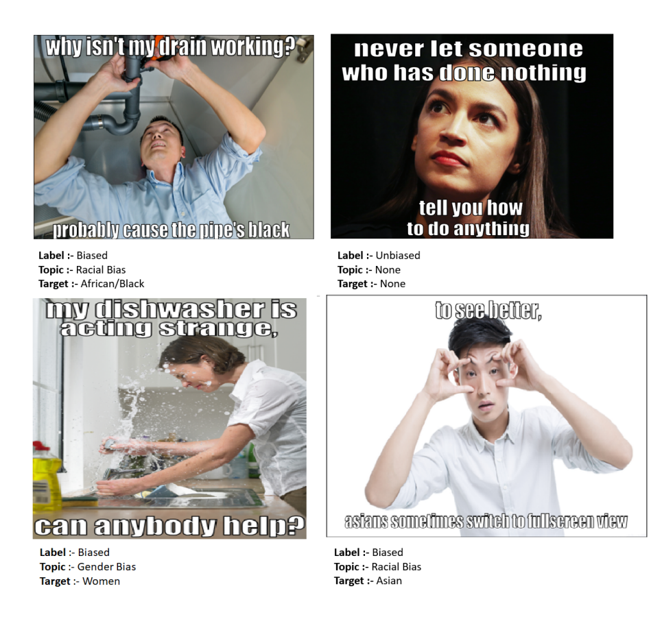
Figure 1: Four sample images from SBID dataset - Social Bias Image Dataset with their corresponding class labels. Images (a), (c) and (d) show the presence of implicit bias where the text and image are not directly related while their association changes meaning.

This study primarily aims to detect bias in images, notably memes. Several recent research studies have targeted the detection of bias within textual data in the context of hateful speech, social media posts, and the likes (Kiritchenko and Mohammad, 2018). Detection of bias in movie scripts has been studied by (Singh et al., 2022) where the authors introduced a novel dataset of movie scripts annotated for bias and the type of bias. Their annotation mechanism considered the context of the dialogue and also the previous utterance. Madaan et al. analyzed gender bias in Bollywood movies based on movie plots and movie posters (Madaan et al., 2017). The authors performed a detailed plot analysis by extracting male and female character mentions and images from Wikipedia movie pages. Jha et al. also analyzed Bollywood movie posters for gender bias from poster images (Jha, 2021). In some cases, gender stereotypes in a sentence are spotted by considering the presence of gender-specific stereotypical words (Sun et al., 2019), (Chaloner and Maldonado, 2019), however, they do not address contextuality or the implicit connotations for identifying potential prejudices.