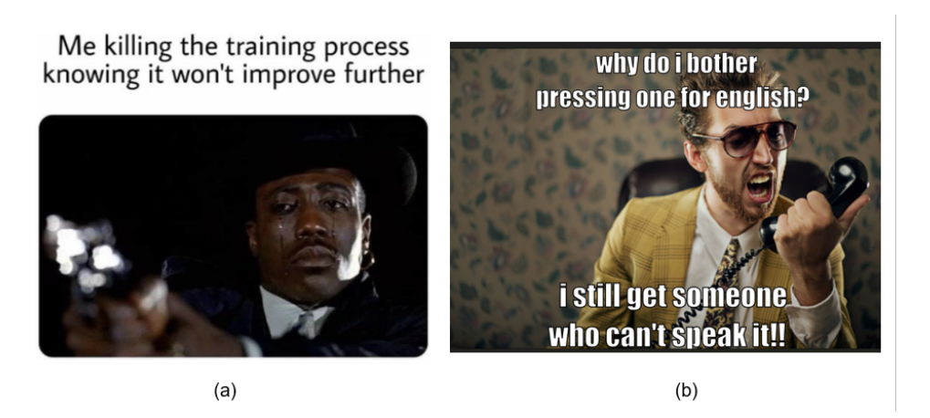
Figure 7: Instances of misclassifications from SBID dataset

instances. Figure 7a shows an example of an unbiased image case where our model inaccurately labeled as a biased image belonging to the "race" category. This might be due to the reason that the word "killing" in the text is inappropriately associated with the word "black man" in the caption. Figure 7b shows an example of a biased image while our model labeled it unbiased. This could be attributed to the implicit nature of the content, where the tech support roles are primarily managed by the South Asian community, who are considered not very fluent in English.