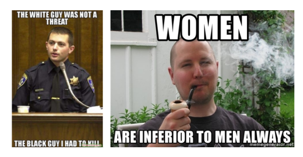
Figure 2: Examples of hateful memes.

priate character attributes and captions.