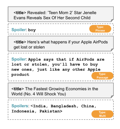
Figure 1: Examples of different categories of clickbait spoilers in Webis (Hagen et al., 2022) dataset.

However, detecting, categorizing, and generating these spoilers involves sophisticated Natural Language Processing (NLP) techniques (Kurenkov et al., 2022). Furthermore, the type of required spoiler can vary from a short phrase to an extended