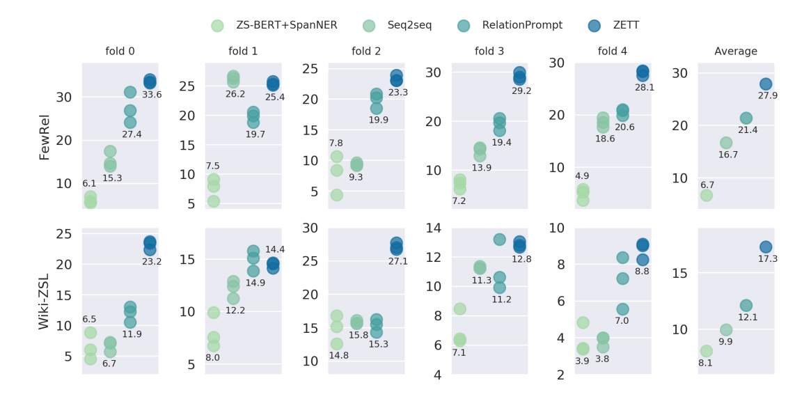
Figure 3: Results of each data fold in the single-triplet setting with m=10. We experiment on three different random seeds. Each point is the accuracy (%) of each evaluation and labeled numbers are an average of three results. Final column shows average over all folds.