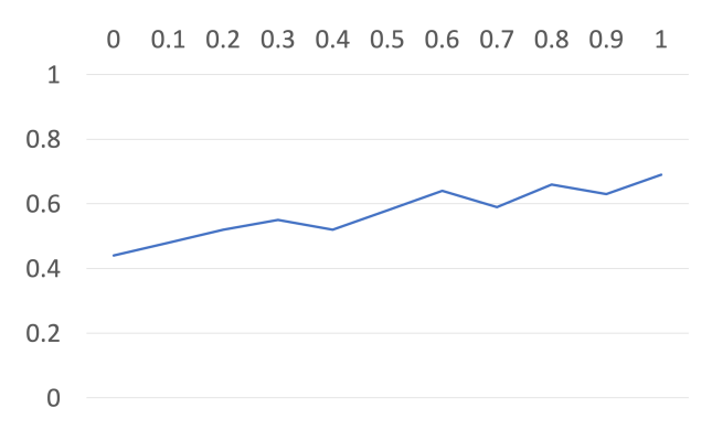
Figure 2: Evaluation of debias controlled models using FN evaluation method. The vertical axis shows the bias score, and the horizontal axis shows r.