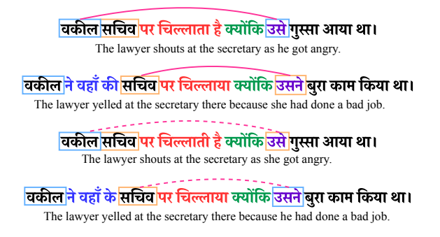
Figure 3: Sample Sentences in WinoMT-Hindi. The solid line shows pro-stereotypical coreference, while the dashed line shows anti-stereotypical coreference. Male and female (stereotypically) entities are marked in blue and orange boxes, respectively. Hindi pronouns are marked in blue or orange box based on the actual gender of their referred entity according to the grammatical context.

Figure 2: Sentence Template for WinoMT-Hindi. When Entity 1 is referenced, we use gender-inflected verb to specify its gender. When Entity 2 is referenced, its gender is specified using gender-inflected relational postposition or an adjective. Phrase after the conjuction (containing the pronoun which refers to either entity) is gender neutral.