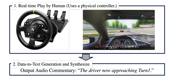
Figure 1: The workflow of our demo. a) user plays a racing game using a physical controller; b) our system generates commentary by analyzing the race situation.

Our system works with a physical controller for real-time gameplay in a racing game (Assetto Corsa). During gameplay, the system tracks the user's data, such as speed, steering rotation, and