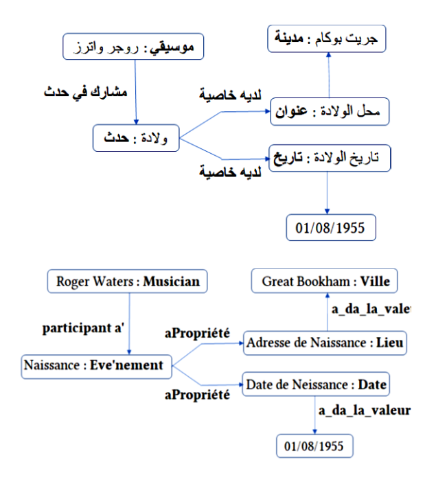
Figure 3 : Since entity names, types, attribute values, and primitive relations are language agnostic, there's a straightforward automatic translation of the KG in figure 1b into isomorphic Arabic and French KGs.

Similar results were obtained by changing various semantically similar relations (e.g., bornIn vs. placeOfBirth , etc.)