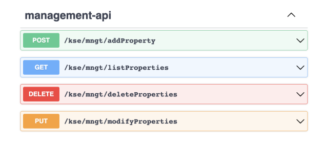
Figure 2: Administration endpoints.

The information management is completely done through endpoints that are accessible through