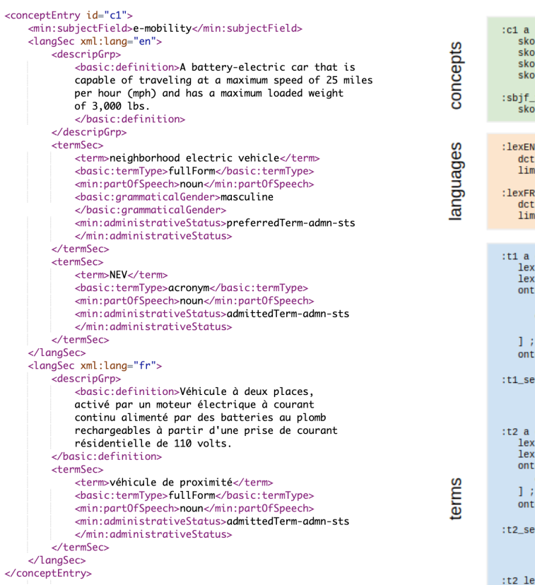
Figure 2: A TBX-basic dialect example.

Our converter performs the conversion and the result is reported in Figure 3. RDF triples are encoded in turtle syntax, and they are grouped according to the TBX entities they correspond to.