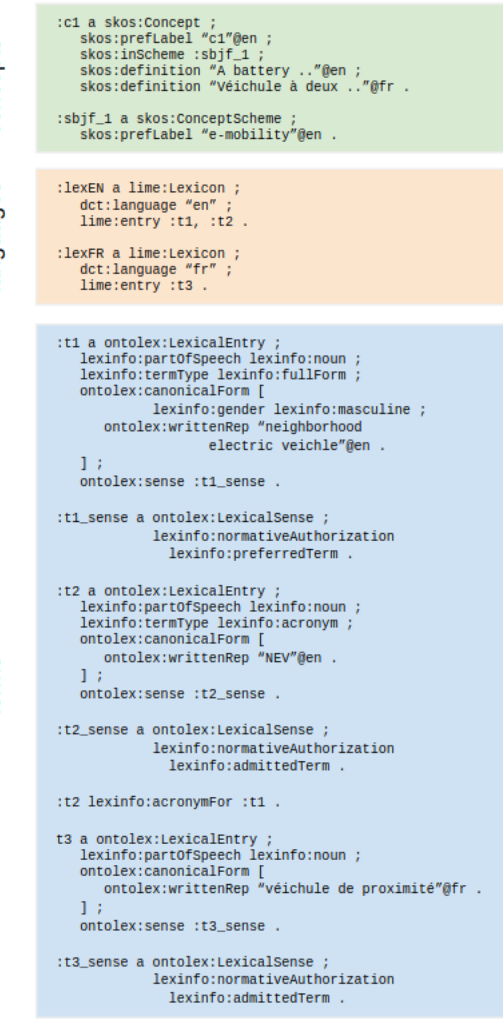
Figure 3: The converted data in lemon is serialized by means of the turtle syntax.

Concerning the <langSec> entity, the related lemon lexica are created. Referring to the example in Figure 2, both English and French lexica are defined as in the second group of triples in Fig-