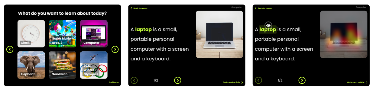
Figure 1: Menu View: Topic overview. Selection by touch and eye-tracking.

Figure 2: Reading View: A text about 'laptop' with the focus word laptop and a image about laptops.