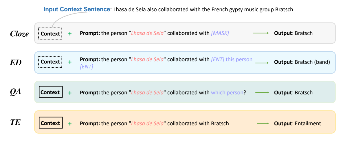
Figure A1: An illustration of different prompts for querying language models. The dashed lines mean the context sentence is optional.

Masked LMs aim to predict masked text pieces based on the surrounding context, and BERT-base and BERT-large (Devlin et al., 2019) are used. To enable BERT to handle multi-token facts, we also introduce the decoding strategy proposed in X-FACTR (Jiang et al., 2020a) for comparison.