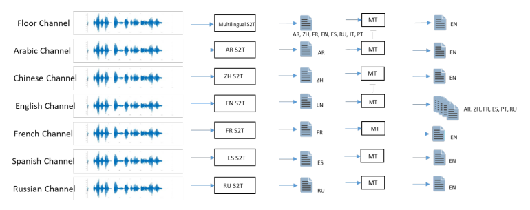
Figure 3: Inputs and outputs

In this section, we describe our decoding pipeline. Figure 3 illustrates various inputs and outputs of our system.