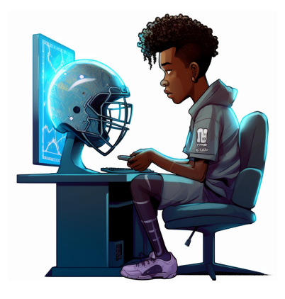
Figure 1: Conversational AI systems are increasingly being integrated into the daily lives of many. While their improved quality is a welcome change, their personalization increases the tendency to anthropomorphize them, which has legal and psychological risks.

Anthropomorphization refers to ascribing humanlike traits to non-human entities, and has been used in diverse areas encompassing literature, science, art, and marketing (Ghedini and Bergamasco, 2010; Dunn, 2011; Spatola et al., 2022). It occurs when humans assign emotional or behavioral traits to entities. Several behavioral psychology studies have posited and argued that anthropomorphization is a