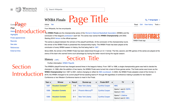
Figure 2: An example of table-associated text in the context of Wikipedia, where the input to the DTR textencoder includes the page title, the introduction to the article, the section title, and the introduction paragraph.

query at inference, the retrieved table is closest to the query in the embedded space, indicated by the upper-left portion of Figure 1.