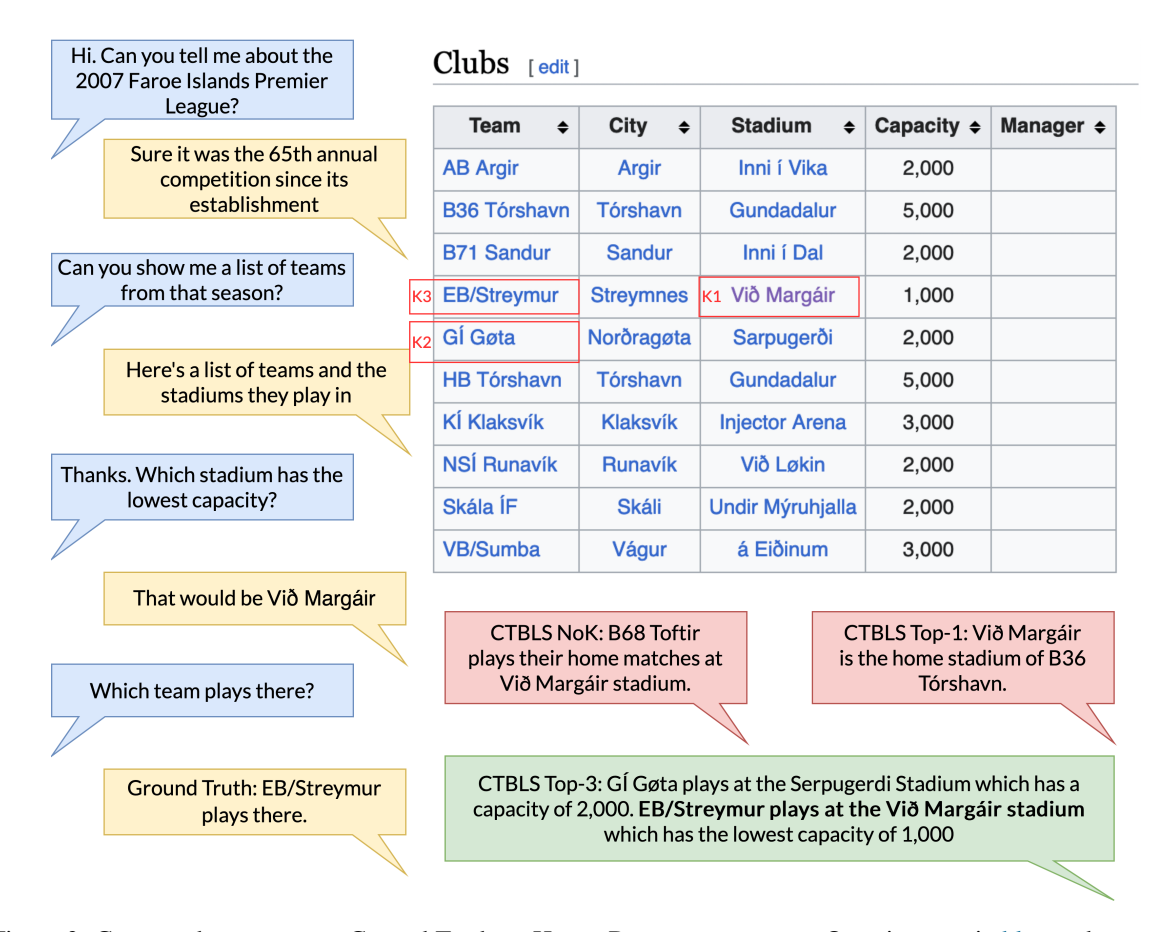
Figure 3: Generated responses vs Ground Truth on HYBRIDIALOGUE test set. Questions are in blue and responses in yellow. K1, K2, and K3 represent the Top 3 knowledge sources ranked by relevance to the query "Which team plays there?". cTBLS Top-3 is able to leverage K3 to generate the correct response while cTBLS NoK hallucinates a response and cTBLS Top-1 generates an incorrect response based on K1. Table obtained from Wikipedia available here