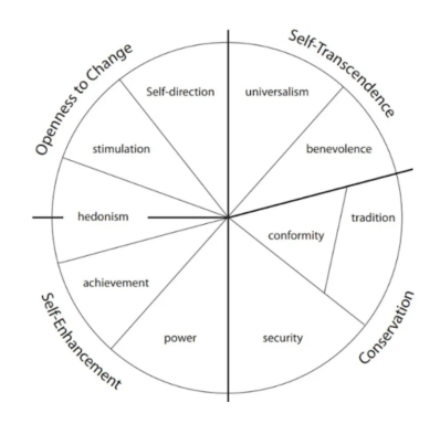
Figure 1: Theoretical model of relations among ten motivational types of values (Schwartz, 2012).

Openness to Change relates to an individual's need for independence of thought, action, and feelings, and readiness for change, therefore comprises the values of Self-direction, Stimulation, and partly Hedonism. On the other hand, Conservation relates to the values of Security, Conformity and Tradition, as it emphasises the individual's needs for order,