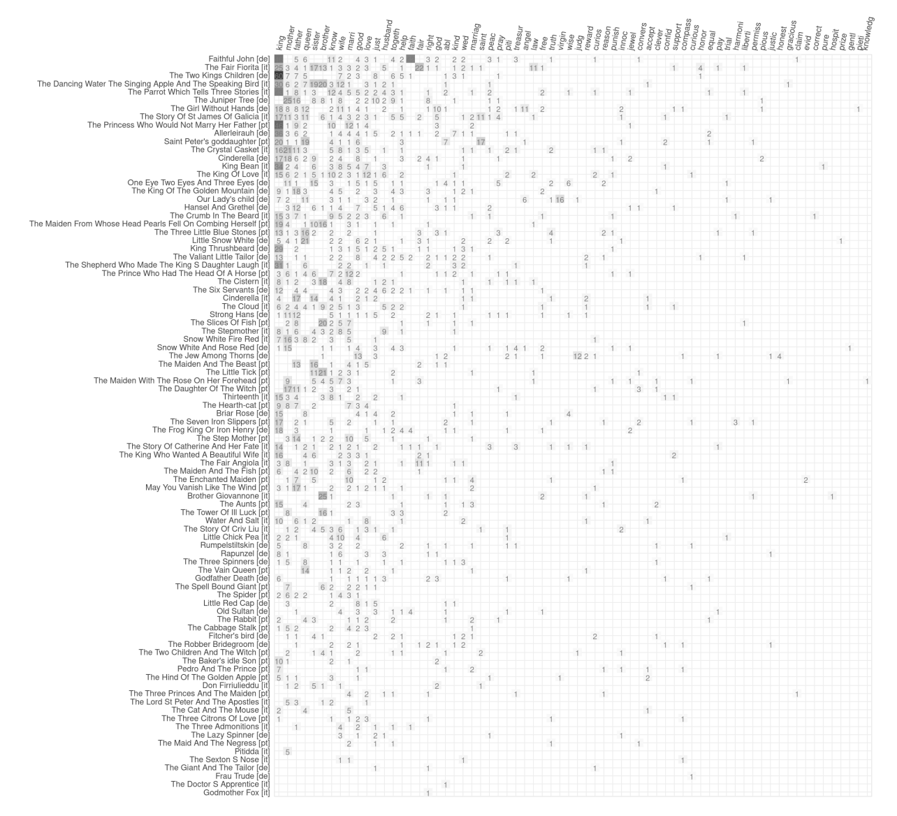
Figure 7: Counts of identified occurrences of tokens across the texts of the three corpora. An interactive version of this heatmap is available at https://tales.ko64eto.com. In it clicking on a number takes you to the corresponding text for easier review.