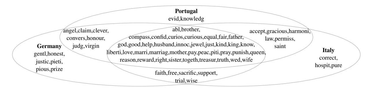
Figure 6: A Venn diagram showing the occurrences of tokens across the national corpora.