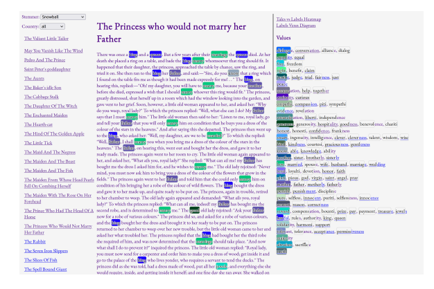
Figure 3: Screenshot of a browsing page from the bespoke web instrument that reviews the produced annotations. Another view shows a clickable heatmap as Figure 7 in Appendix, which allows for a distant reading view.

veloped for the purpose web interface (Figure 3, accessible online at https://tales.ko64eto.com) that allows for a review of the texts in the corpora with the results of the automatic annotation highlighted in different colours. The outcome of this was a series of decisions to adapt the token selection as a way to refine it and guide subsequent iterations of this annotation process. Correspondingly, following this approach inspired by grounded theory (Rieger, 2019), the ultimately proposed list of tokens in this study emerges from exploration of the corpus and is not a result of deductive hypothesis research. We provide a statistical overview of the results of this annotation process in Table 2 and in Appendix we provide both the complete final version of our tokens and a Venn diagram of the occurrences of groups of synonym token across the three corpora.