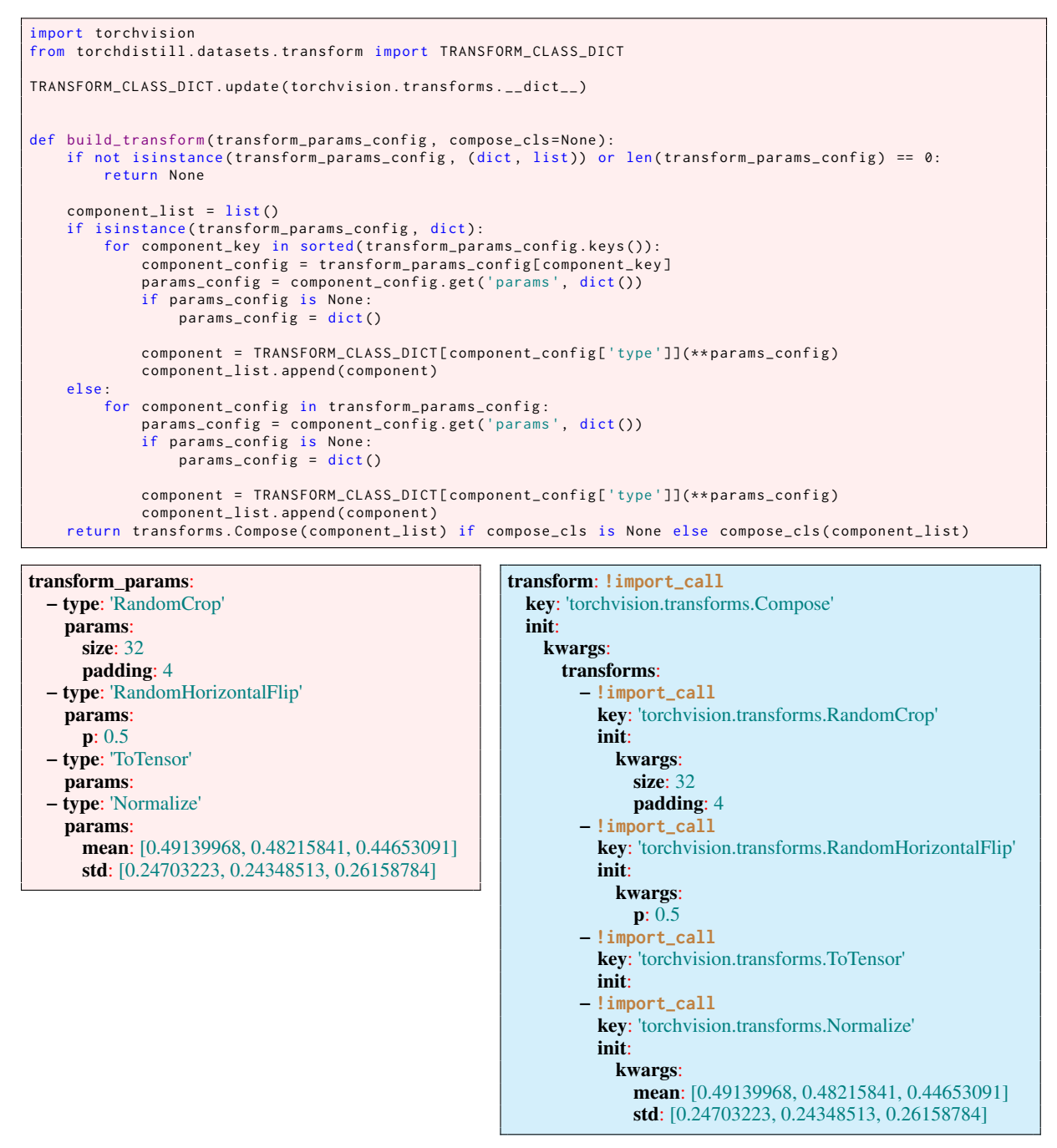
Figure 2: Example of two different ways to build a sequence of transforms in torchvision ( transform ) for CIFAR-10 dataset. The initial version (top, left) defines a function for torchvision build_transform in torchdistill and gives the function a list of dict objects in the left PyYAML as transform_params_config. torchdistill in this work (right) can build exactly the same transform by instantiating each of the transform classes step-by-step with <code>!import_call</code>, one of our pre-defined PyYAML constructors in the upgraded torchdistill.

torchdistill's dependency on torchvision and generalize its modules for supporting more tasks.