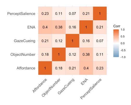
Figure 1: Correlation matrix between the independent properties.

in their natural environment (higher ENA ), they are more likely to be linked with a telic affordance. This discovery aligns with the concept of telic affordance by Henlein et al. (2023), denoted as "a conventionalized configuration to activate a conventionalized function." Namely, a container with purposeful functions in a conventionalized scene is likely to be intentionally used.