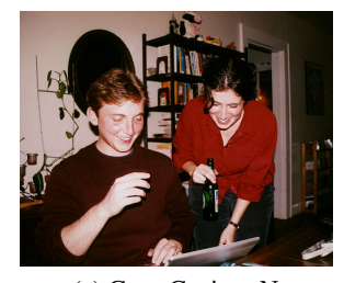
(e) Gaze Cueing: N