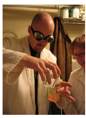
(d) Gaze Cueing: Y