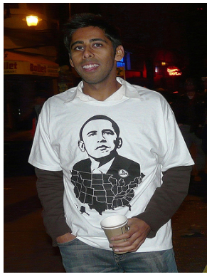
(b) ENA: 1