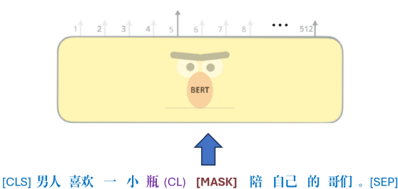
Men like a small bottle (CL) of [MASK] to accompany their buddies.

[CLS] 男人 喜欢 一 小 瓶 (CL) 酒 陪 自己 的 哥们。[SEP] Men like a small bottle (CL) of wine to accompany their buddies.