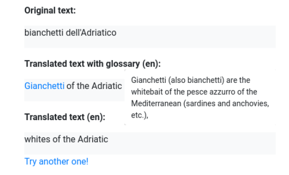
Figure 4: A snapshopt of the system interface showing bianchetti dell'Adriatico . At the bottom the default (wrong translation). In the middle, the correct and augmented partial translation: 'Gianchetti of the Adriatic'.

Entity linking aims at identifying the unique identity of an entry. This kind of technology is commonly supported on linking text to encyclopedic entries. Such a process is also known as wikification, in which the entities are linked to the Wikipedia in order to augment the comprehensibility of a text. One of the first approaches was Wikify! (Mihalcea and Csomai, 2007), which relied on a combination of steps to perform keywordmatching and disambiguation independently. Babelfy (Moro et al., 2014) is another alternative, but its approach to word disambiguation targets to identify all concepts which, for our purposes, results in over-identification. In recent approaches, entity linking is modeled with neural models that perform the task of entity finding and linking at once (Kolitsas et al., 2018). Through a dual encoder, the model proposed by Botha et al. (2020) can link entities in multiple languages. We do not opt for any of these