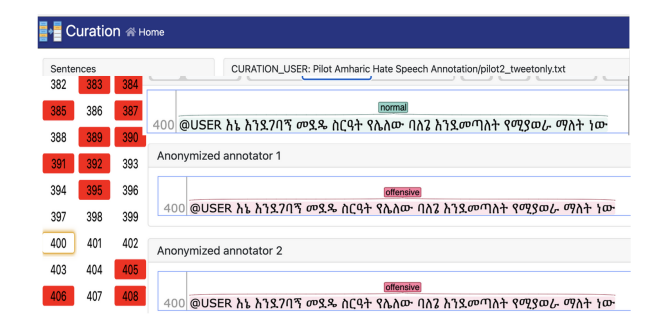
Figure 4: Sample deviations between annotators and the adjudicator taken from WebAnno (Yimam et al., 2013)

Hate speech annotation is highly subjective and challenging even for human annotators (Fortuna et al., 2022; Ayele et al., 2022a). During the pilot study, we observed disagreements between annotators on their annotation labels due to the subjective nature of hate speech annotation. In some cases, the curator also deviated from both annotators and selected a different annotation label. Such annotation errors were analyzed with examples as presented in Figure 4. Despite hate speech annotation is a very subjective task, we tried to understand the different views of annotators using expert judgments. Three experts, a lawyer (Assistant professor in Law), a political science expert (Ph.D. student), and a journalism expert (Associate professor of media and communications) were engaged in a focus group discussion to analyze the potential sources of annotation disagreements between the annotators as well as the adjudicator. The experts evaluate the annotation deviations and suggest possible justifications for the source of the disagreements on the labels of those tweets. In general, we observed that hate speech annotation is a highly context-sensitive and challenging task (Ayele et al., 2022a), which usually resulted in lower inter-annotator agreements.