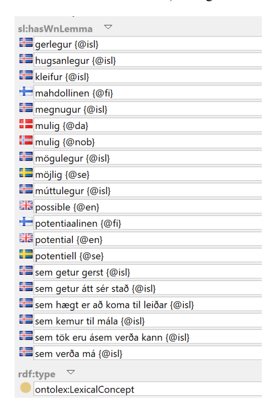
Figure 3: The Nordic (and English) WordNet lemmas we could extract from the consulted sources, and encode in OntoLex-Lemon as values of an instance of the class ontolex:LexicalConcept

We describe in this section first steps towards an extension of our approach to other Nordic Sign Languages. We could already start integrating a larger number of Nordic languages in our infrastructure, when considering the OMW and other sources for language specific wordnet datasets, as can be seen for the concept "potential, possible" (with OMW ID "00044353-a") in Figure 3.