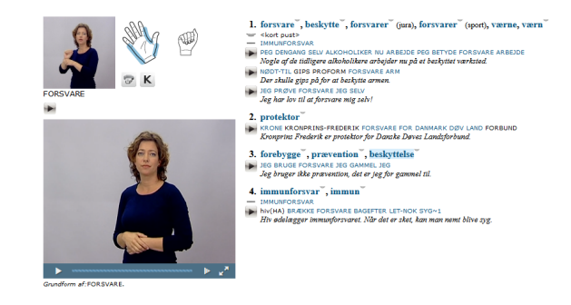
Figure 2: The Danish sign associated with the OMW ID "00817680-n", corresponding to the (highlighted) lemma "beskyttelse", here as one possible lexical realisation of the Danish gloss "FORSVARE" (defend)

tionary sources are encoded in a database, from which we got the TSV export. In this export, looking at the entry corresponding to the page displayed in Figure 2, we first have the sign_gloss ("FORSVARE"), written in capital letters, as this is a good practice in SL datasets for indicating that we are dealing with a very generic concept or term for annotating a sign. This gloss is related to the word/lemma "beskyttelse", marked as a noun, with its English translation ("protection").