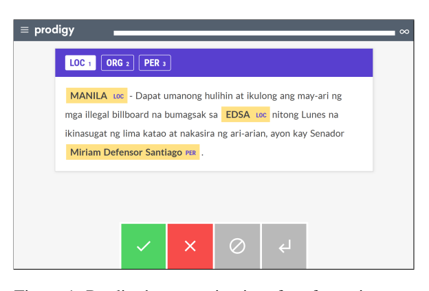
Figure 1: Prodigy's annotation interface for a given text. (Translation: MANILA - The owner of the illegal billboards that fell on EDSA this Monday, injuring five people and damaging property, should be caught and imprisoned according to Senator Miriam Defensor Santiago.)

Annotation Process The annotation process was done iteratively with three annotators (including the author) who are native Tagalog speakers. Given