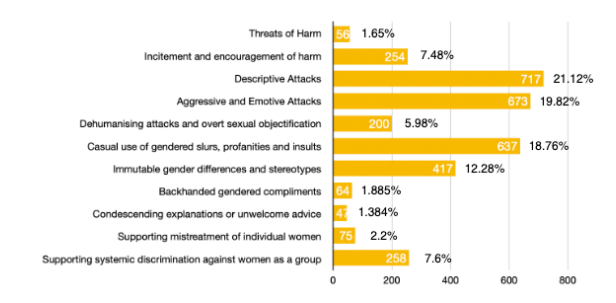
Figure 2: Frequencies of Task C labels in training set

advice in Animosity; (4.1) Supporting mistreatment of individual women and (4.2) Supporting systemic discrimination against women as a group in Prejudiced discussions, as shown in Table 3.