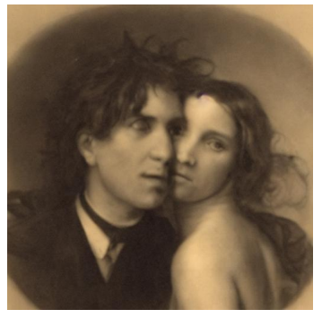
"Adamo ed Eva" (Adam and Eve)

Figure 4: Examples of generated images from the Stable Diffusion model with the generating prompt.