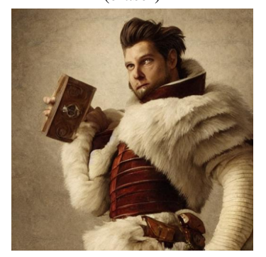
"Alfiere si muove in diagonale" (bishop moves diagonally)