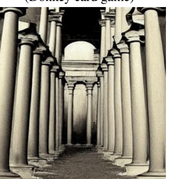
"Colonna missione" (mission column)