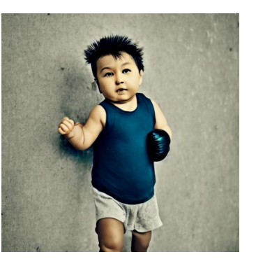
"Box per infanti" (children playpen)