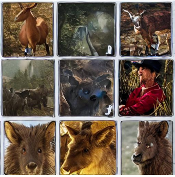
"Asino gioco di carte" (Donkey card game)