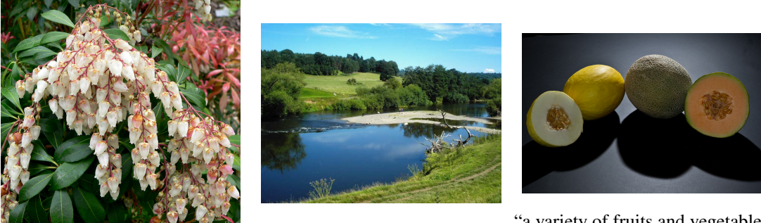
"a lake with a river and a bench", "a variety of fruits and vegetables on 0.086 on a table", 0.135