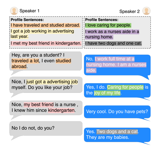
Figure 1: An example dialogue where each turn contains the corresponding profile sentence.

Zhang et al. (2018) introduced PersonaChat, a dataset comprising a collection of profile sentences ( persona ) that reflect each speaker's individual characteristics and personal facts. These profiles serve as a knowledge base for promoting the consistency between utterances from speakers, and various recent dialogue models have incorporated this information using diverse techniques (Song et al., 2020, 2021; Cao et al., 2022).