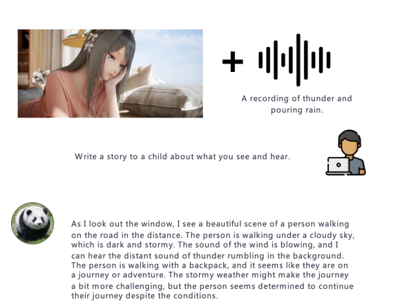
Figure 5: Example showing PandaGPT's capability in multimodal arithmetic (Image and Audio).

ageBind for the content in other modalities than text. More research into fine-grained feature extraction such as cross-modal attention mechanisms could be beneficial for the improvement of performance.