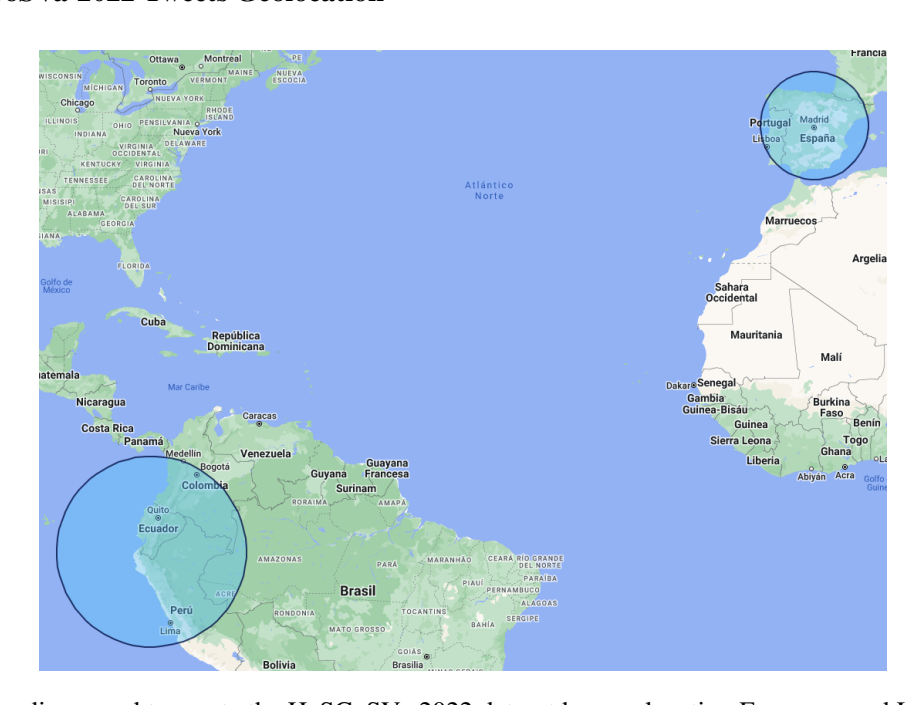
Figure 2: Boundings used to create the HaSCoSVa-2022 dataset by geo-locating European and Latin American tweets.