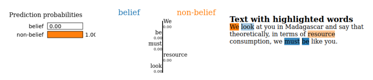
Figure 3: lime analysis of a false negative example in which the model incorrectly judges a sentence with the first person pronoun we as non-belief. This could be happening because the dataset the model was trained on (quality controlled MTurk) focuses on reported (non-author) beliefs, so the word we does not get associated with beliefs.