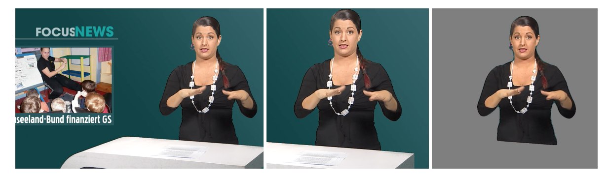
Figure 1: Illustration of video preprocessing steps (cropping, instance segmentation and masking). From left to right: original frame, cropped frame, masked frame. Taken from Müller et al. (2022).

Table 2: Comparison between SRF training data of the 2022 and 2023 edition of the WMT-SLT shared task. Subtitle segmentation=ensuring that each subtitle unit is one entire sentence. Subtitle alignment=Subtitle times are either manually corrected to match the signing in the video (manual) or are matched with the audio track (audio).