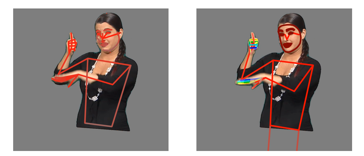
Figure 2: Examples of the output of pose estimation systems overlaid over the original video frames. Left: OpenPose, right: MediaPipe Holistic. Taken from Müller et al. (2022).

Table 3: Examples of automatic sentence segmentation for German subtitles. The subtitles are formatted as SRT, a common subtitle format. Taken from Müller et al. (2022).