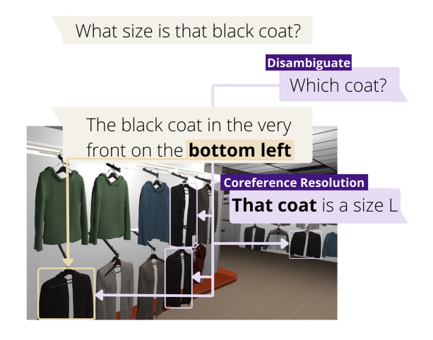
Figure 1: Example dialogue from the SIMMC 2.0 dataset where the system engages in a clarificational exchange to find the correct coat mentioned by the user.

are not enough, as they do not easily carry information across turns and/or are able to ground the information to the objects in the scene.