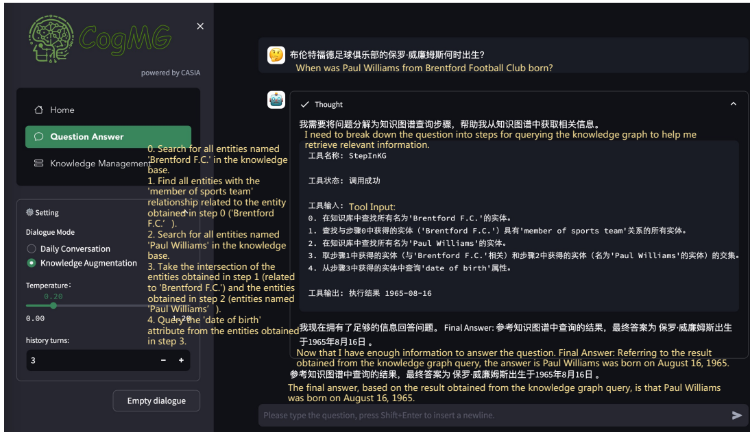
Figure 3: System screenshot.

pability of generative models. Besides end-to-end generation, Chen et al., 2021 suggested first identifying the entities and schema involved in the problem separately and then utilizing the transducer to generate logical expressions, ensuring the accuracy of logical syntax. Finally, it employs a checker to enhance the semantic consistency of the logical form. With the assistance of LLM, KB-BINDER (Li et al., 2023) generates a draft of logical expressions using codex and then matches executable programs based on BM25 scores. Thanks to in-context learning, the process can be accomplished with just a few annotated examples. Moreover, LLMs’ reasoning and planning capabilities can also serve as better assistants for utilizing knowledge graphs without additional training (Jiang et al., 2023a; Sun et al., 2023; Jiang et al., 2024; Liu et al., 2024b). However, these works mainly focus on answering questions within the confines of a given dataset without addressing scenarios where the knowledge graph lacks the necessary information for the question. The agent framework (Yao et al., 2022; Qin et al., 2023; Liu et al., 2023) allows for the autonomous selection of alternative tools when faced with knowledge graph misses by design. However, it does not utilize these gaps as opportunities to enhance the knowledge graph.