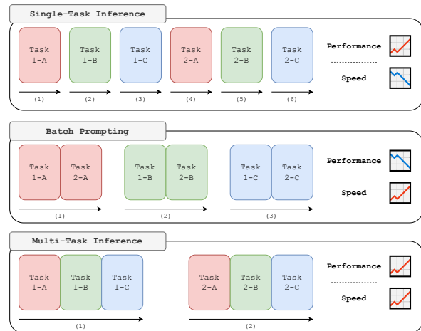
Figure 1: Comparison of the three inference methods for handling tasks composed of three sub-tasks: SINGLE-TASK INFERENCE, BATCH PROMPTING, and MULTI-TASK INFERENCE. MULTI-TASK INFERENCE shows reliable performance as SINGLE-TASK INFERENCE and provides faster speed as BATCH PROMPTING (Cheng et al., 2023).

Large language models (LLMs) capable of following instructions have demonstrated impressive performance across a wide range of tasks (Xu et al., 2023; OpenAI, 2023; Anil et al., 2023; Tunstall et al., 2023; Wang et al., 2023a). However, since LLMs are trained to follow a single instruction per inference call, it is questionable whether they also hold the ability to follow complex instructions that necessitate handling multiple sub-tasks (Yang et al., 2018; Geva et al., 2021; Cheng et al., 2023). Moreover, current evaluation resources are either confined to measuring the LLM’s capability in following one-step instructions (Li et al., 2023; Chiang