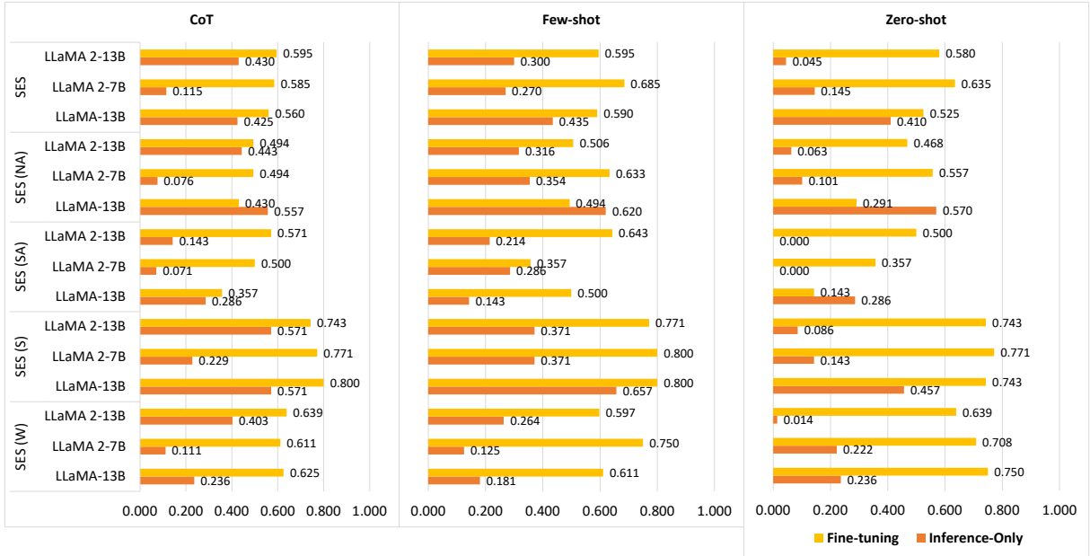
Figure 3: Per-relation performances of fine-tuned and inference-only LLaMA and LLaMA 2 families. NA: Necessary Assumption . SA: Sufficient Assumption . S: Strengthen . W: Weaken .