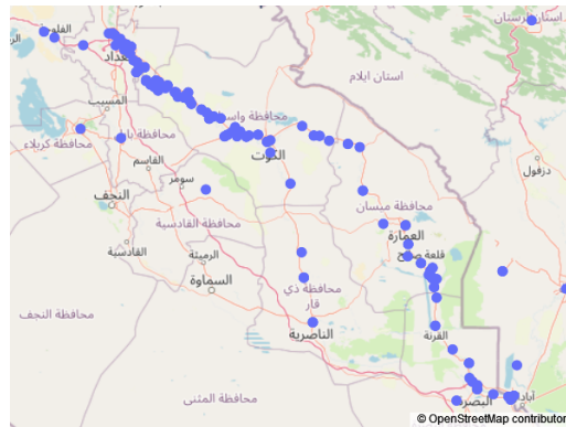
Figure 1: Plot of toponyms near the Tigris River system.

In his capacity as a purser, Svoboda regularly traveled by steamship up and down the Tigris River between Baghdad and Basra. He typically begins each entry with the time, date, and weather, and documents his travels, including when he stops along the river for any period of time. As such, most of the locations in the diaries are clustered near the Tigris River, as in Figure 1.