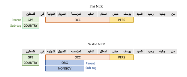
Figure 1: An example of the hierarchy tagging in flat and nested NER on Wojood Fine-Grained Corpus.

In our work, we explore a new method utilizing the T5 encoder-decoder architecture instead of the BERT encoder architecture.