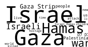
Figure 4: Word Cloud for Unbiased.

In contrast, the word cloud for bias against Israel features terms such as "Israel," "Gaza," and "Palestinian." Figure 3 depicts the prominence of "Gaza" and "Palestinian" alongside "Israel" suggests that the negative bias against Israel often revolves around its actions and policies towards Gaza and the Palestinian people. Words like "war," "attack," and "killed" also appear frequently, indicating that the discourse often highlights violent interactions and casualties associated with Israel.