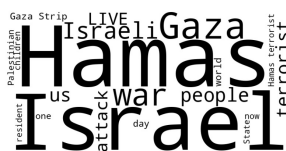
Figure 2: Word Cloud for Bias Against Palestine.

The summary graph in Figure 1 indicates that around 40% of the analyzed statements were biased against Palestine, while 19% were biased against Israel, and only 29% were unbiased. This indicates a disproportionate representation of the war in media, which is problematic as it not only distorts the public perception of the war but is also unethical to provide unbiased reporting. This underscores the critical need for unbiased journalism.