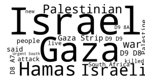
Figure 3: Word Cloud for Bias Against Israel.

As seen from Figure 1, the topmost labels were Biased against Palestine, Biased against Israel, and Unbiased. The word cloud of the top 20 words were analyzed in these three labels to gain insights into the prominent themes and biases. In the word cloud representing bias against Palestine as shown in Figure 2, the term "Hammas" is the most prominent. This prevalence indicates that most of the biases against Palestine were linked to Hamas, suggesting that the portrayal of Hamas significantly contributes to the negative bias towards Palestine. Words such as "terrorist" and "attack" frequently co-occur with "Hammas," reinforcing this negative perception.