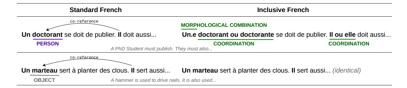
Figure 1: Overview of our research problem and proposed solution: while translating from Standard to Inclusive French requires semantically-heavy capacities, such as knowing which nouns refers to a person or an object, or resolving co-references, the two main processes of Inclusive French, morphological combination and coordination, can be easily detected with a regular expression and a syntactic parser, respectively. Gender-marking words are printed in bold.

This reasonably large dataset enables further studies on Inclusive French translation, e.g., on the importance of vocabulary and tokenization, and comes with a rule-based system that can be readily applied to larger French corpora and could be extended to other languages<sup>8</sup>. Fabien.ne BARThez could be used directly by interested users. In NLP, it could also be applied either as pre-processing (e.g., when translating "un.e doctorant.e se doit de publier" to English, or post-processing (e.g., "French Ph.D. students are under-payed" may be translated either to Standard or Inclusive French depending on the user's preference).