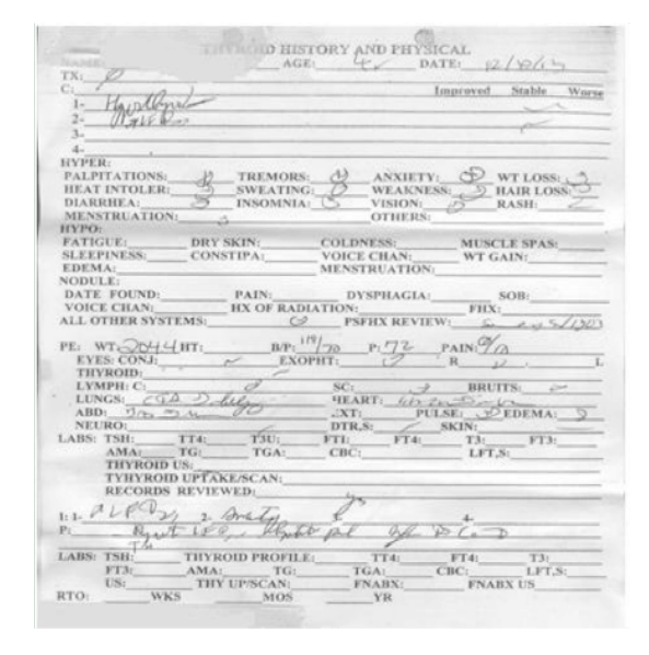
Figure 1: Sample real world obscure image of an outpatient paper-based patient encounter form comprising of numerous sections (Hersh and Hoyt, 2018).

Modern day healthcare systems are increasingly moving towards large scale adoption of maintaining electronic health records (EHR) of patients (Congress, 2009). EHRs help healthcare practitioners with relevant information about a patient such as history, medications, etc. However, in recent times this practice has led to very long and convoluted EHRs (Rule et al., 2021). Naturally, the need for better information retrieval tools emerged due to the progressively lengthy and unstructured doctor notes. One such need is the accurate identification of sections in an EHR, pertinent to a physician's inquiry. For instance, a question like "What