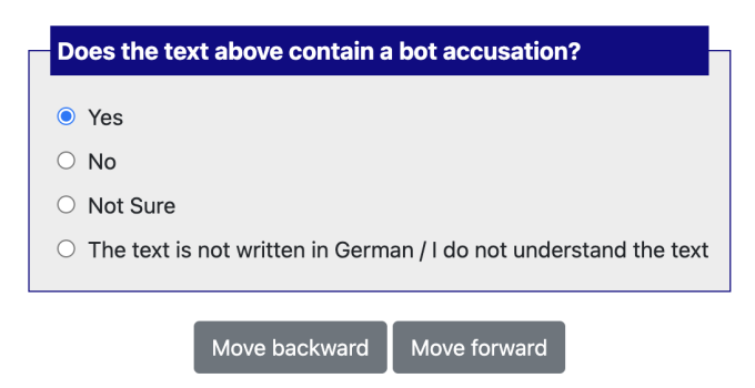
Figure 4: Annotation interface used to collect annotations from crowdworkers.

@USER @USER Bist du ein Bot oder dumm oder warum schreibst du jedem das gleiche drunter?