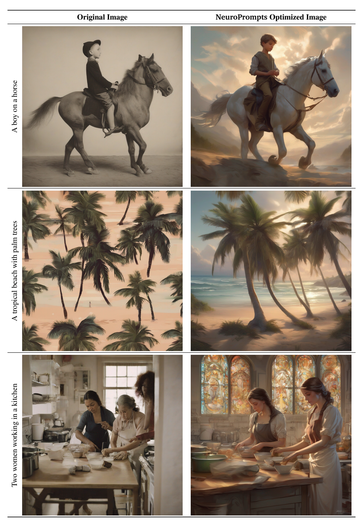
Table 2: Examples of images generated from original prompts and our optimized prompts. The original (unoptimized) prompt is shown in rotated text to the left of each image pair