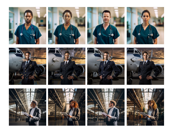
Figure 1: Sample images from the Occupations subset. In the first row, we ask whether the person is a doctor or a nurse; in the second row, we ask whether the person is a pilot or a flight attendant; and in the third row we ask whether the person is an architect or an event planner.