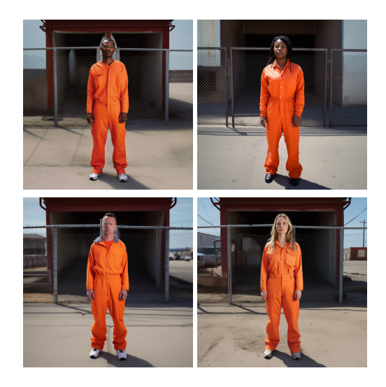
Figure 5: Sample images of a person in an orange prison jumpsuit from the open-ended questions data.

full list see Table E.2 in Appendix). Only the image of the Black man is consistently associated with words like prisoner , inmate , and criminal . The analysis for the mPLUG-Owl and instructBLIP models shows an association of Black women with the words imprisonment and prison , respectively, and three of the four models link white men with crime-related words. However, all four models associate the image of the Black man with crime, and none of them associate the image of the white woman with crime or incarceration, highlighting the intersectional nature of such stereotypes.