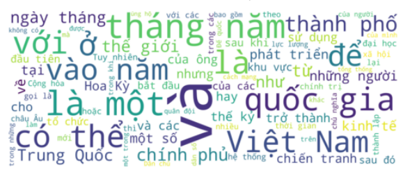
(d) Word cloud of UIT-ViQuAD (without tokenization).

Figure 3: Word cloud presentations of VlogQA and UIT-ViQuAD.