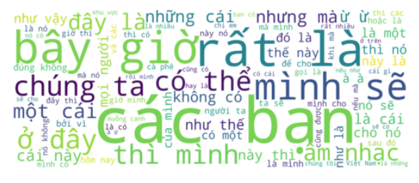
(c) Word cloud of VlogQA (without tokenization).