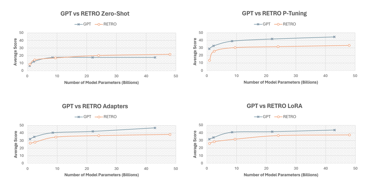
Figure 4: GPT vs RETRO seperate method comparisons.