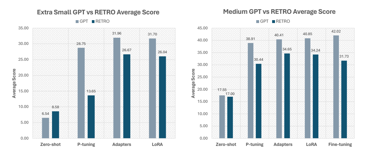
Figure 3: GPT vs RETRO comparisons on Extra Small and Medium sized models.