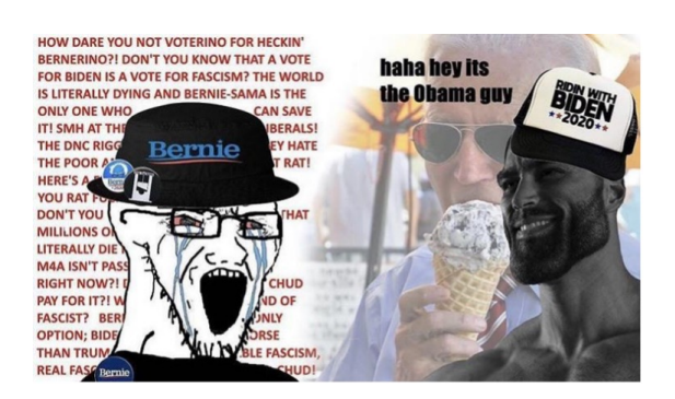
Figure 18: An example of a meme for editing text.