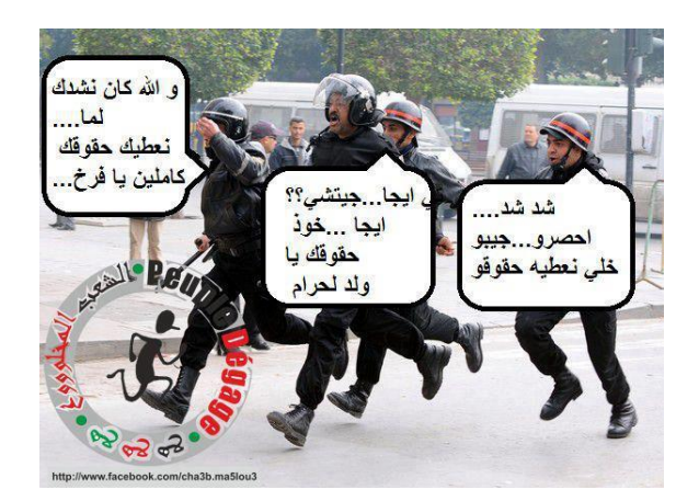
Figure 9: An example of a meme for editing text.