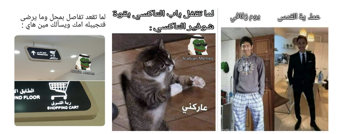
Figure 7: Examples of images labeled as not propaganda.