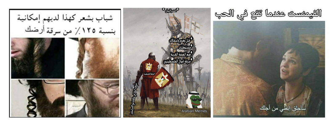
Figure 16: Examples of images labeled as propaganda.