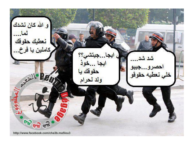
Figure 17: An example of a meme for editing text.