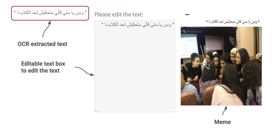
Figure 12: An screenshot of the annotation platform for the text editing.

قد يكون في الصورة كيان يقوم بفعل ما، فيستخدم .7 الفعل لإنشاء معنى مع التعليق المكتوب. قد يكون في الصورة كيان (منظمة أو شخص)، فيستخدم .8 ما يمثله ذلك الكيان لإنشاء معنى مع التعليق المكتوب. يكثر استخدام صور وحوارات مأخوذة من أفلام .9 ومسلسلات وإضافة تعليق عليها. تعليق فكاهي أخر. ملاحظة: إنشاء المعنى مختلف عن إضافة المعنى، فنقصد في النقاط ٢-٨ أن عدم وجود تعبير الوجه أو الفعل أو الكيان سيغير المعنى أو سيكون المعنى غير مكتمل.