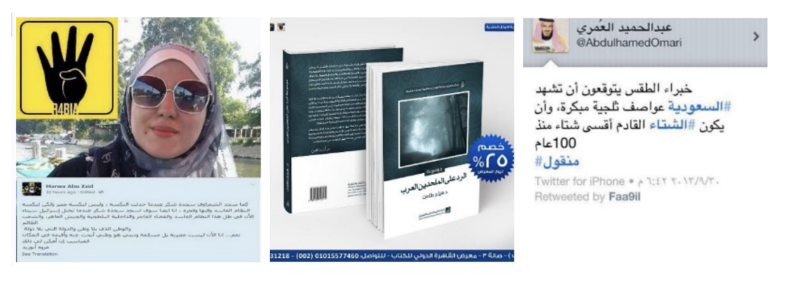
Figure 5: Examples of images labeled as not-meme .