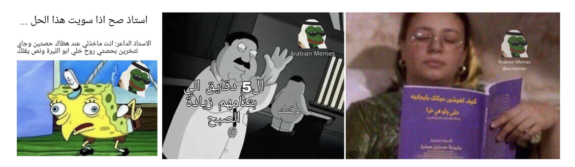
Figure 6: Examples of images labeled as other.