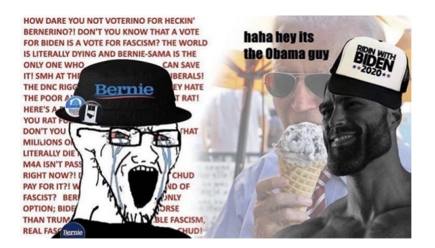
Figure 10: An example of a meme for editing text.