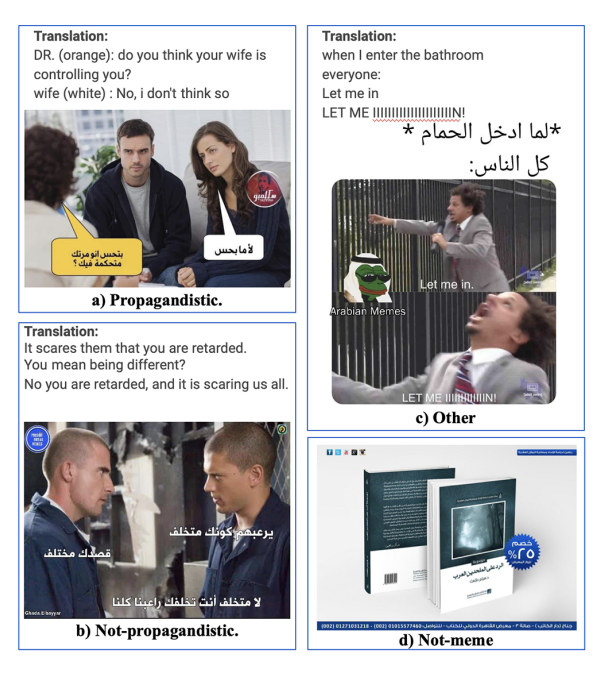
Figure 1: Examples of images representing different categories.

Social media platforms have enabled people to post and share content online. A significant portion of this content provides valuable resources for initiatives such as citizen journalism, raising public awareness, and supporting political campaigns. However, a considerable amount is posted and shared to mislead social media users and to achieve social, economic, or political agendas. In addition, the freedom to post and share content online has facilitated negative uses, leading to an increase in online hostility, as evidenced by the spread of disinformation, hate speech, propaganda, and cyberbullying (Brooke, 2019; Joksimovic et al.,