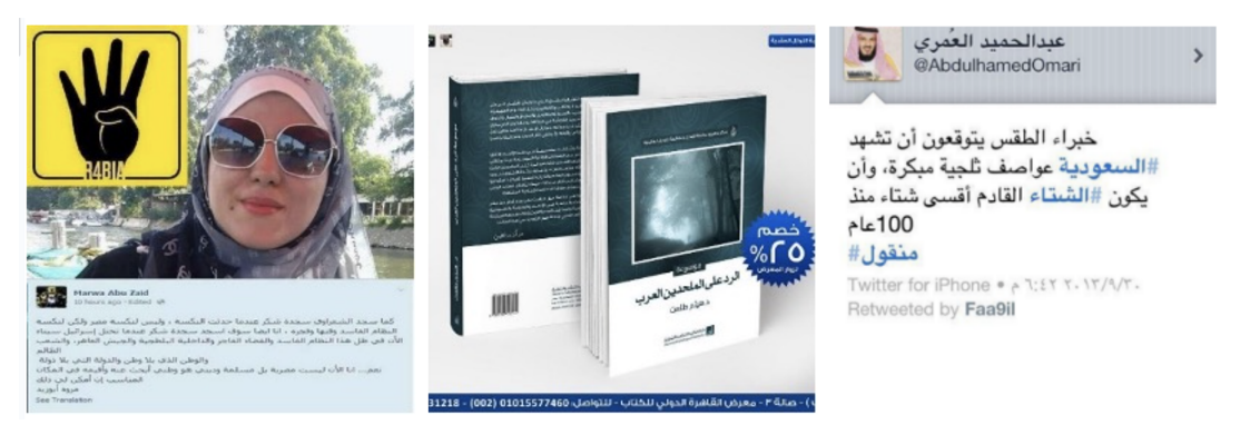
Figure 13: Examples of images labeled as not-meme.

(2) Other: Figure 14 يندرج تحت هذا التصنيف الصور التي تتبع تعريف الميمز ولكنها تقع تحت واحدة من المعايير المحددة في القسم أدناه. المعايير والأمثلة: ألميمز التي تعتمد على مناظر وشخصيات كرتونية، ما عدا 1. التي تحتوي على معنى مسيء لشخصيات سياسية أو مشهورة أو جماعات وأحزاب معينة. أليمزْ التي تعتمد بشكل كلي على أرقام أو مخططات أو .2 رسوم بيانية. ألميمزْ التي تظهر عرى صريح. 3. أليمز التي تستخدم كلمات نابية ومنحطة وخادشة للحياء .4 بشكل صريح (مثال: ابن الـ******). أليمزْ التي تستخدم لغة ثانية غير العربية. (لا يوجد .5 مثال) أليمز التي لم تتمكن من فهمها بسبب اللهجة أو حجم .6 الخط أو لأى سبب آخر. (لا يوجد مثال) قد تحتوى الميمزْ على كلمات منحطة لكن بشكل ضمني، أو على شتيمة صريحة غرضها تشويه سمعة أو التقليل (مثال: المنافق، السياسي الفاسد). لا تندرج هذه الكلمات أو العبارات تحت هذا التصنيف، فاختر لها ما يناسبها من التصنيفات الأخرى. (3) Not Propaganda: Figure 15