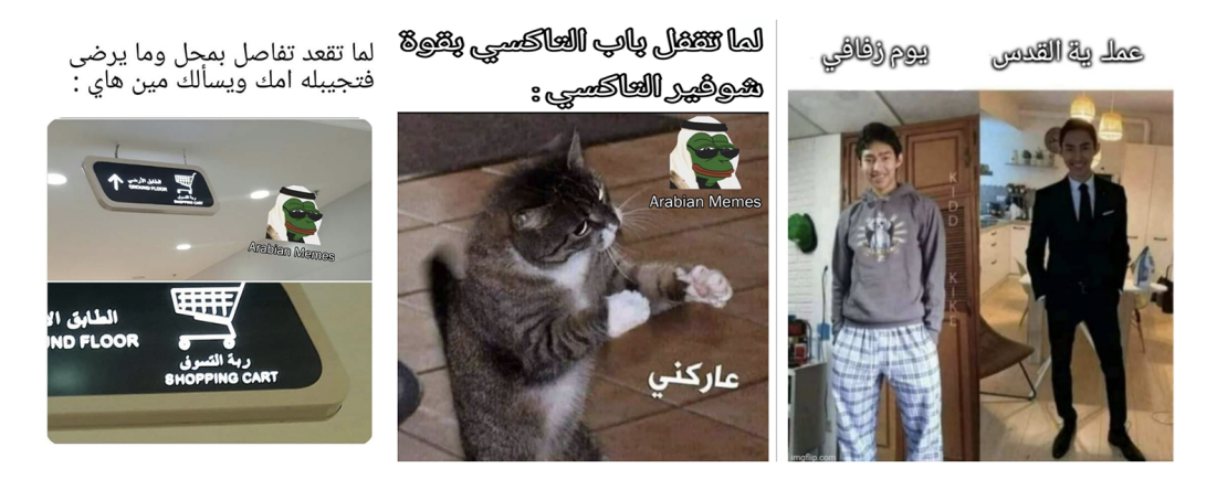
Figure 15: Examples of images labeled as not propaganda.

أى نص مخفى ويصعب قراءته. في حالات خاصة قد تجد أن شعارًا ما استخدم في .8 الميمزْ لإنشاء معنى، عندها أضف نص الشعار إلى النص الذي تحرره. Example 1: Figure 17 ملاحظات على تعديل النص في الصورة: كل مربع حوار يعتبر جملة واحدة 1. إبدأ سطرًا جديدًا لكل مربع (كل مربع هو كتلة نصية .2 مختلفة أزل أي عناصر لا تشكل جزءًا من المعنى: اسم الحساب .3 والموقع ضف أو عدل علامات الترقيم لتناسب المعروض في النص .4 النص بعد التعديل: 5. شدشد احصروجيبو خلى نعطيه حقوقو ايجاجيتشى؟؟ ايجا خوذ حقوقك يا ولد لحرام والله كان نشدك لما. نعطيك حقوقك كاملين يا فرخ