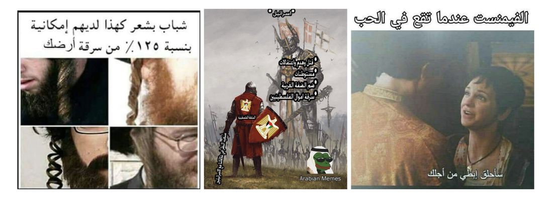
Figure 8: Examples of images labeled as propaganda.