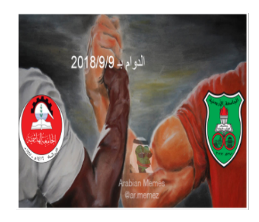
Figure 19: An example of a meme for editing text.