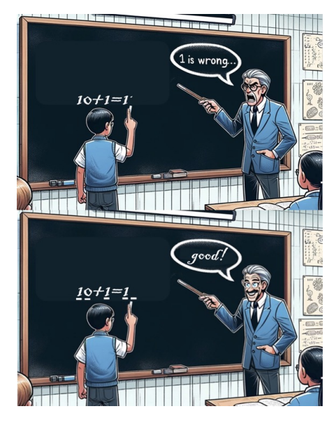
Figure 1: Reading numbers in a causal manner from left to right is sub-optimal for LLMs, as it is for humans. The model has to reach the final digits of a number before it can infer the place value of the first digit. To address this, we propose "NumeroLogic", a numerical format where digit count is indicated before the actual number. Image by DALL-E 3 (Betker et al., 2023).

Large Language Models (LLMs) struggle with numerical and arithmetical tasks. Despite continuous improvements, even the most advanced models like GPT-4 (Achiam et al., 2023) still exhibit poor performance when confronted with tasks such as multiplying 3-digit numbers (Shen et al., 2023). Recent studies ((Lee et al., 2024; Shen et al., 2023)) have proposed techniques to improve arithmetic in LLMs, such as the Chain of Thought (CoT; (Wei et al., 2022)) method, which pushes the model to anticipate the entire sequence of algorithmic steps rather than just the final output. While these strategies offer valuable insights into the capabilities of LLMs, they primarily concentrate on post-hoc solutions for specific arithmetic challenges and do not present a practical solution for pretraining LLMs.