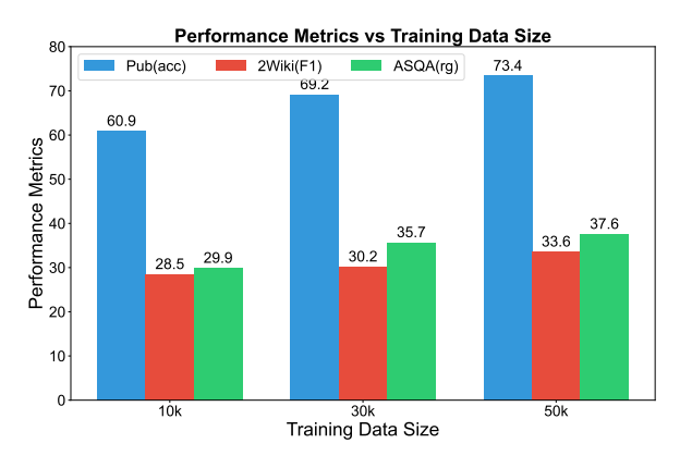
Figure 4: Training scale analysis.

Eventually, we compared global planning and local planning methods. Since RPG involves iteratively generated local plans, we employed GPT-3.5 model to globally annotate all plans for the question. The results in the table shows iterative